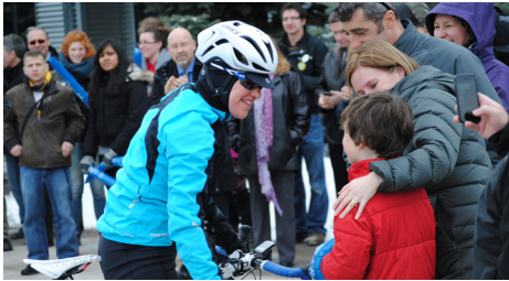
Clara Hughes at Shimano Canada.