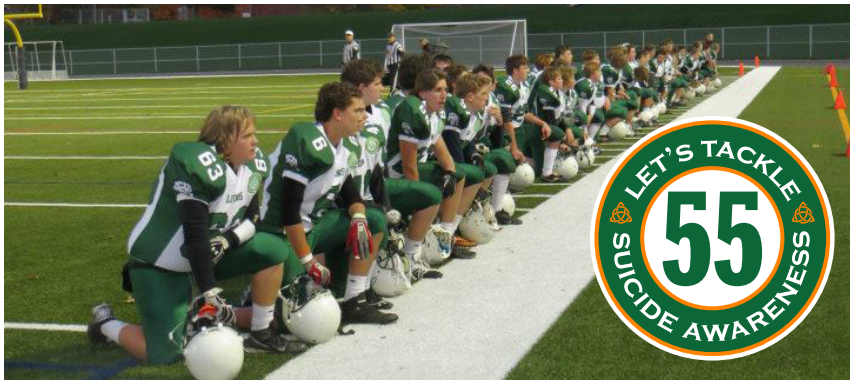
The Adam Scott Junior Football Team at the First Annual Friday Night Lights Football Game.

Two semesters of the pilot curriculum have been delivered at Adam Scott. Team55 has met with the local school board to discuss strategies for the 2014-15 school year, to expand the delivery of suicide prevention education. Team55 has directed $10,000 towards CMHA HKPR programs including Kids on the Block and Four County Crisis, as well as $1,000 to Art for Awareness. Furthermore, investments in suicide prevention training include educating trainers in safeTALK, a suicide prevention program