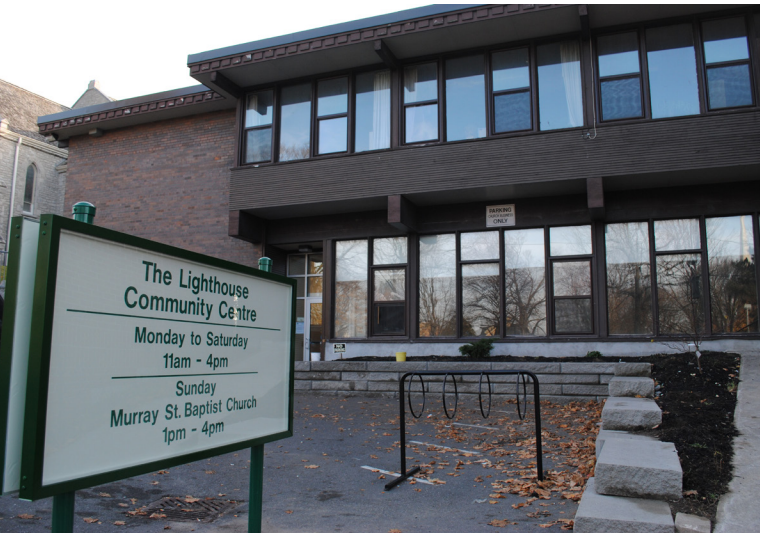
The Lighthouse Community Centre located at 99 Brock Street, Peterborough.

The Lighthouse Community Centre is open 7 days per week and snacks and a meal are provided daily. The Lighthouse served 34,345 meals. 4,129 volunteer hours were contributed to the centre.