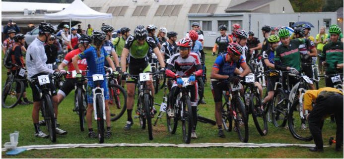
Bikers prepare for the start of the 60K race through the Ganaraska Forest.

Each year the Enduro, which takes place in the Ganaraska Forest, features new trails including 15k, 30k, 60k and 100k challenges. Registration is now underway for the 2014 event, taking place September 20th. To register, please contact www.bloomfieldbicycle.ca .