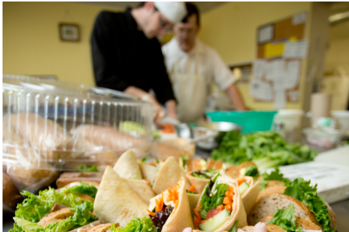
A look inside the kitchen of Catering PLUS, located at 386 Water Street, Peterborough.

Along with these exciting new additions, Catering PLUS also welcomed a new logo and menu makeover.