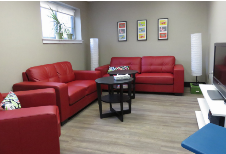
The Lynx Program's youth friendly meeting space at 415 Water Street.

theatre collective, in their creation of “Erasing the Stigma”, to provide education and reduce the stigma associated with psychosis.