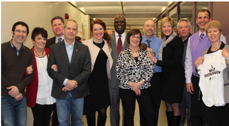
Sponsors of “Mental Health for All”.