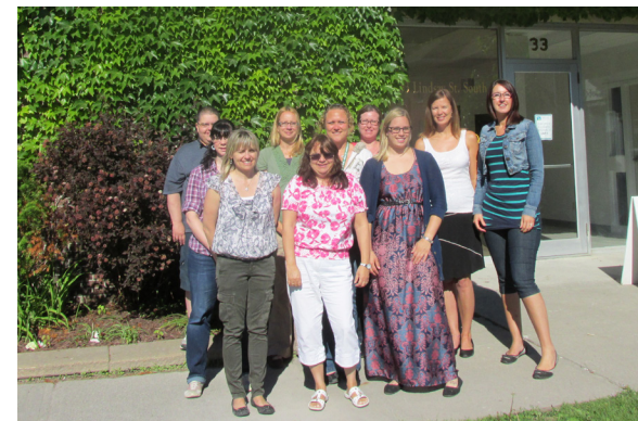
Staff outside our office at 33 Lindsay Street, Lindsay.