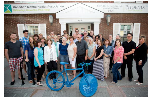
Staff outside our office at 466 George Street, Peterborough.