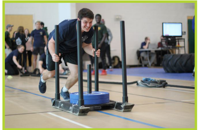
Athletes compete in the third annual First Responders Cup.

Students initiated the First Responders Cup in 2017 following a mental health class that discussed post-traumatic stress disorder in the policing profession. With the goal of eliminating the stigma and bringing more awareness surrounding mental health to the community, the First Responders Cup was born.