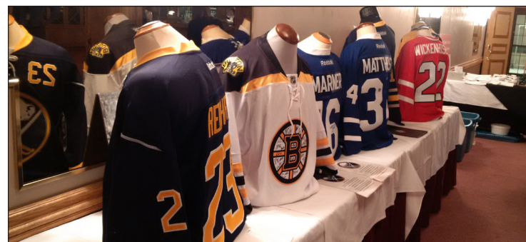
Some of the silent auction items that were available for bidders

$5,000 of the proceeds from the event were directed to support C.M.H.A. H.K.P.R.'s Kids on the Block Program. Kids on the Block uses puppetry to address important issues affecting the mental health of children. The remaining funds are directed towards other suicide prevention initiatives including public education.